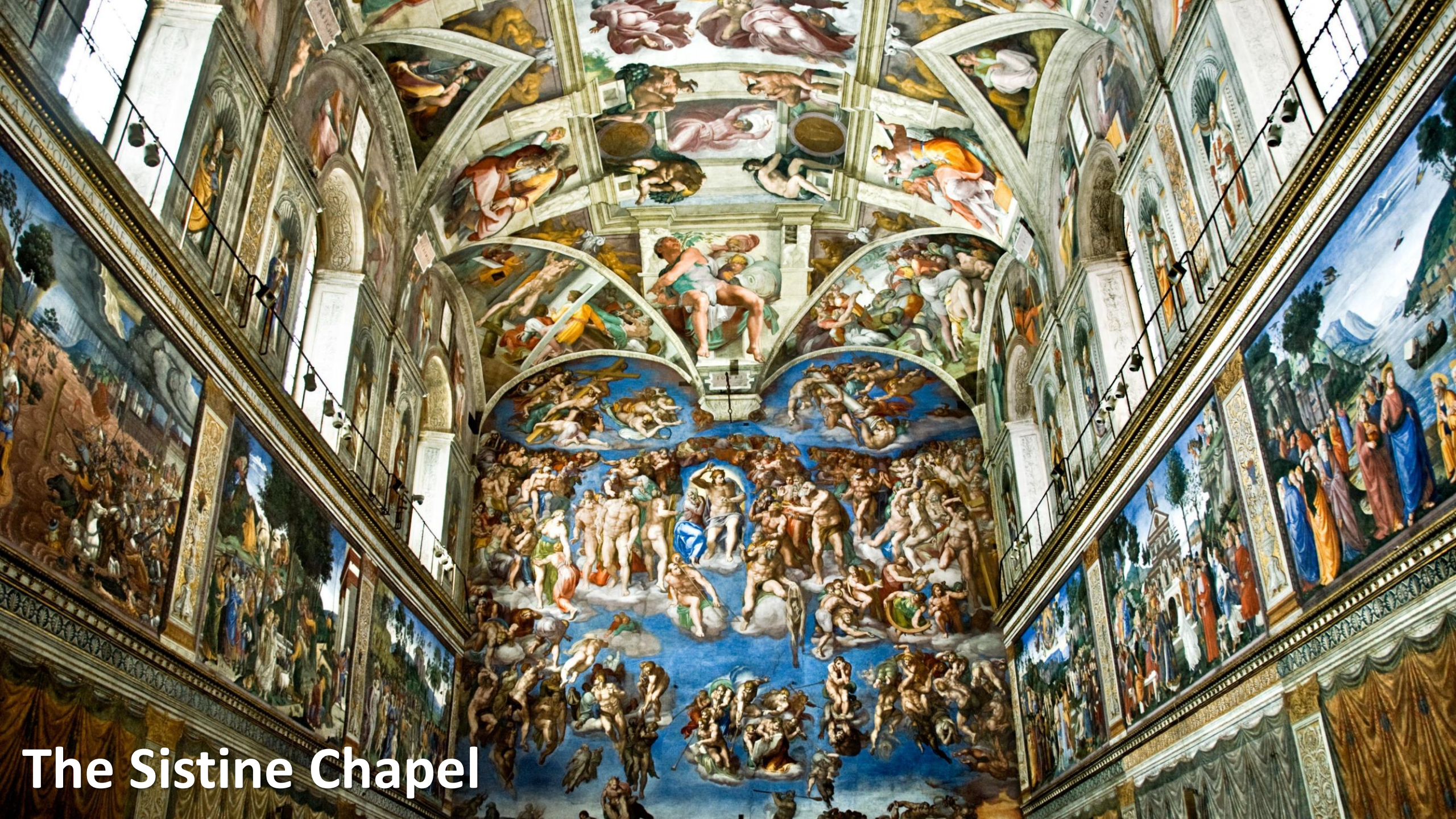
The Sistine Chapel