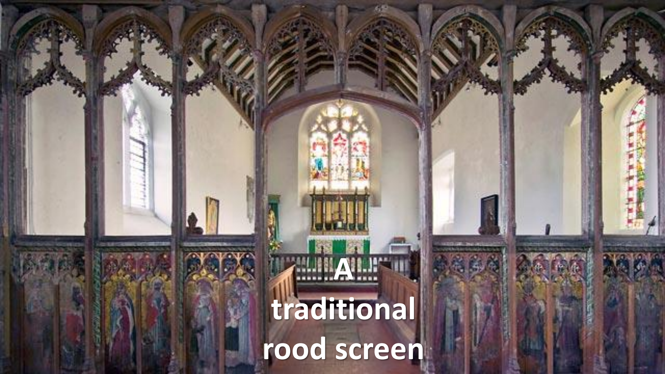
A traditional rood screen